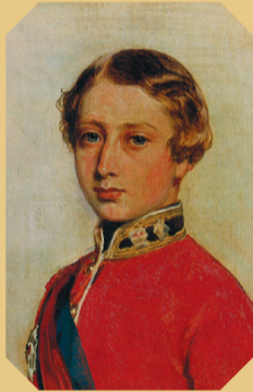
Prince Albert Edward