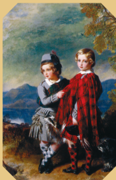
Princes Alfred and Arthur